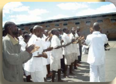
Inmate choir per- forms at a function in a prison in Malawi