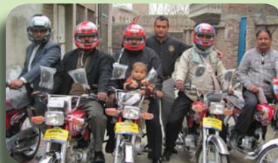
Chaplains in Paki- stan sit on motor- bikes donated to the ministry

Remaining Need: $250,000 Praise the Lord for faithful individuals, churches, and business leaders who have a heart for those in jails and prisons around the world!