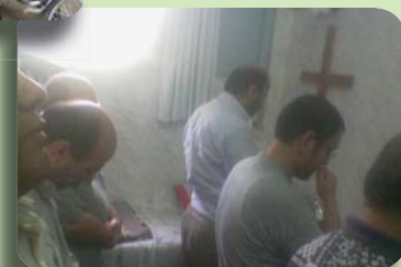
Inmates in an Egyptian prison chapel